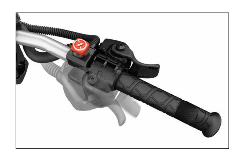
Finger throttle position Throttle block can be rotated to be used as either a traditional thumb throttle or unique finger throttle.

SC<sup>™</sup>-5U articulating rear suspension Features settings that maximize deep snow traction in reverse or lock out for towing.