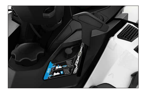
Synchromesh transmission with reverse (2-1-N-R)

Take off from a stop smoothly, even with a heavy load, thanks to two forward and one reverse gears. Inline 2-1-N-R pattern on right side and can be safely shifted while on the fly.