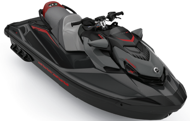
● Eclipse Black and Deep Marsala